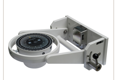
Bearing Repeater Compass 360°/10° w/ Adjustable Bearing Repeater Bracket