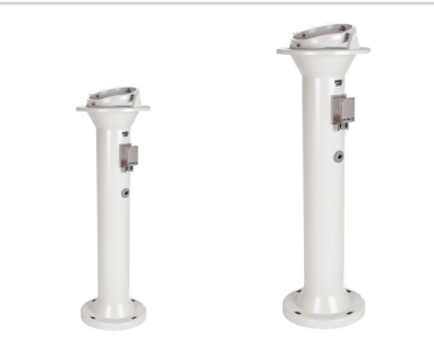
height 1300mm height 1450mm

Bearing Repeater Compass 360°/10° w/ Bearing Repeater Stand