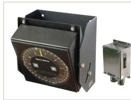
Bulkhead Repeater Compass 360°/10° w/Wall Mounting Bracket