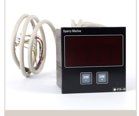
Digital Heading Repeater

Bearing Repeater Compass 360°/10° w/ Bearing Repeater Stand