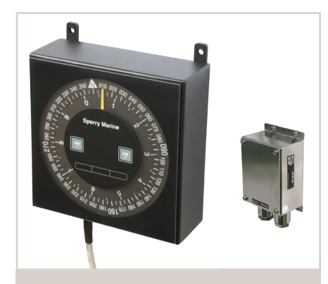
Bulkhead Repeater Compass 360°/10°