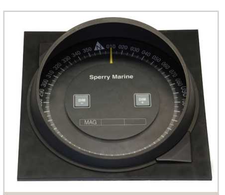
Magnetic Heading Console Repeater 360°