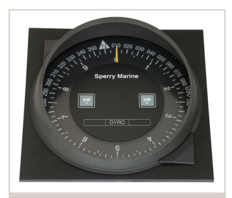
Console Repeater Compass 360°/10°

We have designed all our accessories to combine the ultimate in functionality and practicality. Our hardware is