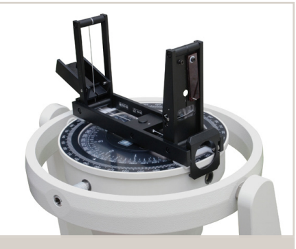
Prismatic Azimuth Device PV 23