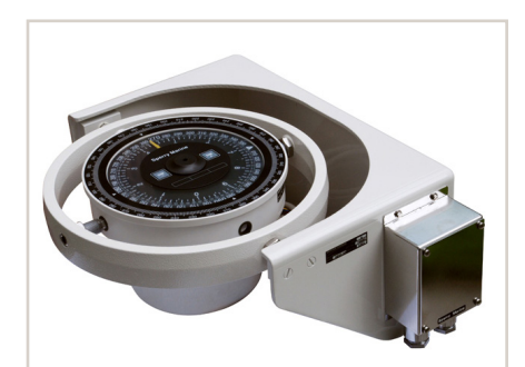
Bearing Repeater Compass 360°/10° with bearing repeater bracket