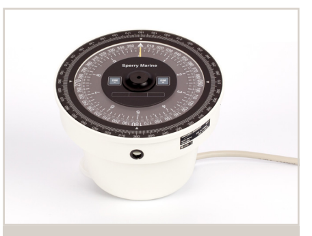
Bearing Repeater Compass 360°/10°