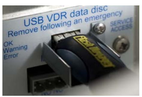
New Removable USB Flash Drive

Data capture – Data can be extracted from the S-VDR system via PC's LAN line or from the removable USB flash drive. This data can easily be imported into a Windows<sup>TM</sup> program for analysis both on board and on shore.